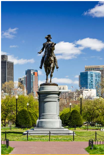
Boston Public Garden